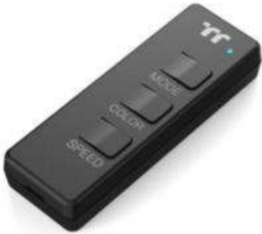
Support LED mod and speed analog control