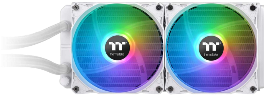
Powerful Cooling Fan