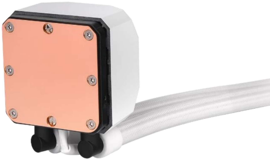
High Performance Water Block