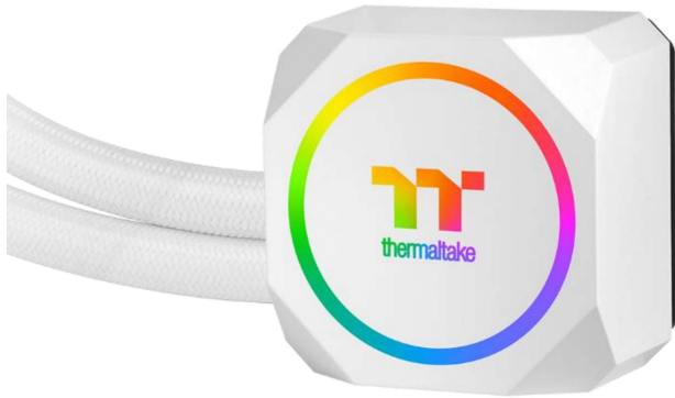
Special LED Water Block Design